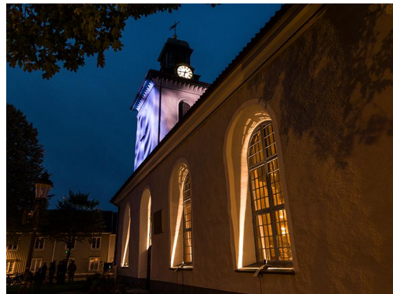
Christinae Church, Alingsas, Sweden