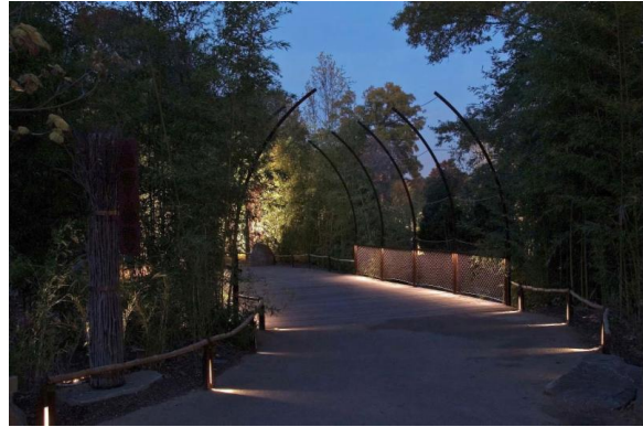
Asia Trail, Washington, DC