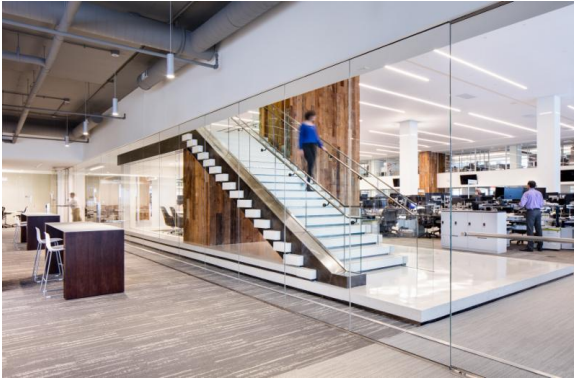
Exelon Baltimore Headquarters, Baltimore, MD